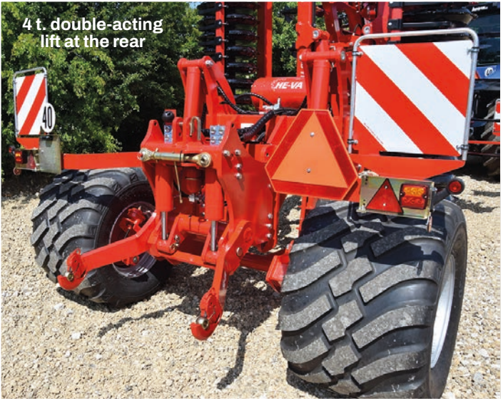
4 t. double-acting lift at the rear