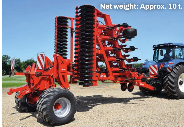
Net weight: Approx. 10 t.

There are various possibilities for the composition of the machine.