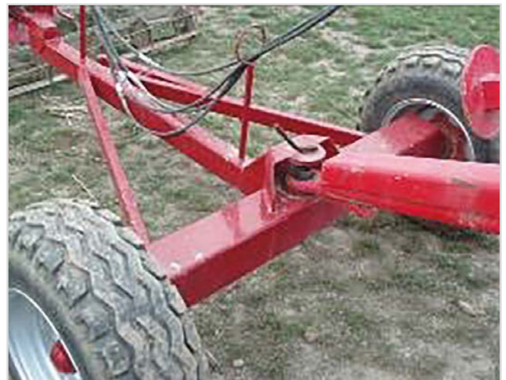
Dolly: wheel set making an attachment of rollers possible behind a harrow - 11.5/80 x 15.3 wheel.