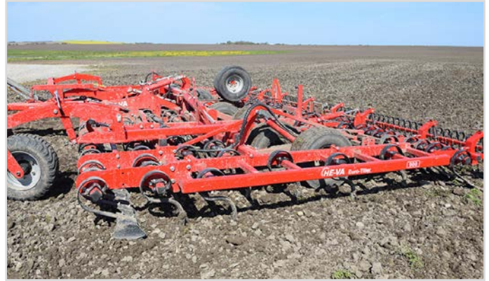
9.00 m Euro-Tiller w/65x12 mm tines w/Spring-Board, extra row of 65x12 mm tines, Spring-Board after-harrow, longfinger after-harrow, and front support wheel