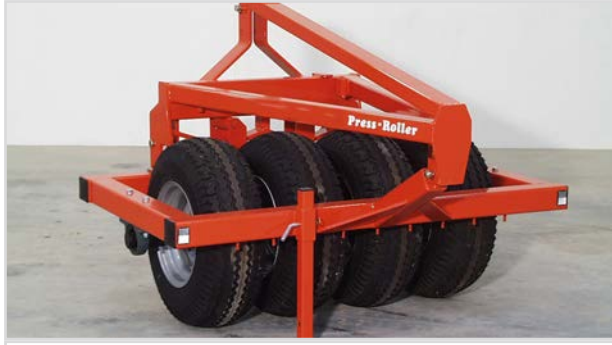
Press-Roller H760, 1.50 m.