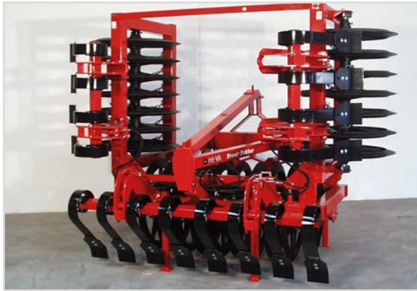
4.00 m with 800 mm rings, hydraulic folding and Spring-Board.