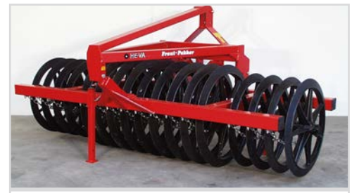
3.00 m with 800/900/800 mm rings.