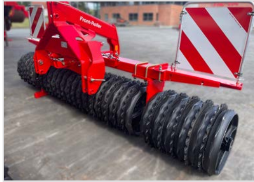
Autonomous front mounted roller with free mobility