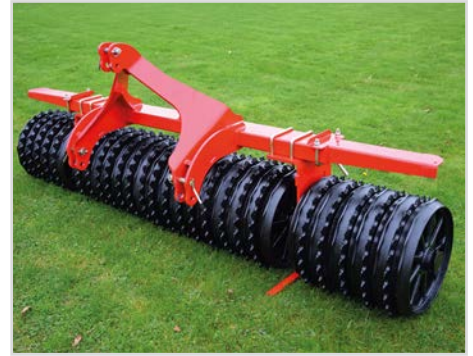
Front-Roller with fixed three-point hitch - not self-steering