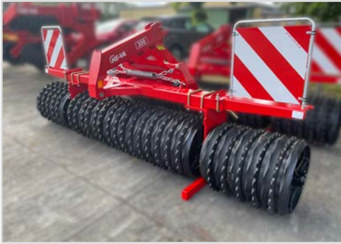
Autonomous front mounted roller with free mobility