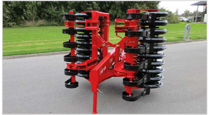
2-section 3.00 m Front-Roller with V-Profile, hydraulic folding and Spring-Board.