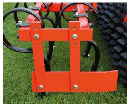
Edge equipment set for front harrow.