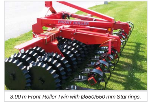
3.00 m Front-Roller Twin with Ø550/550 mm Star rings.