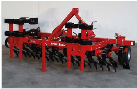
4.00 m Front-Board with slicing plates.