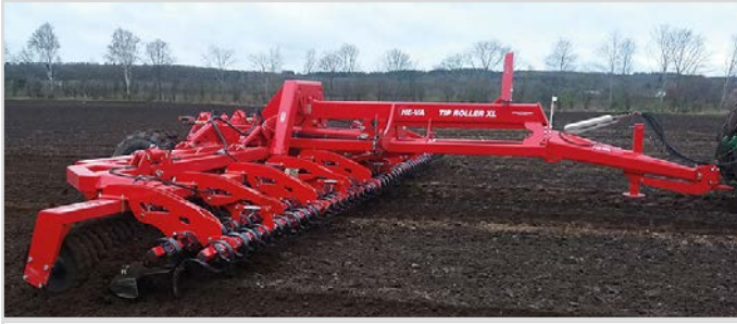
12.30 m Tip-Roller XL with Cambridge rings and 2-row Spring-Board.