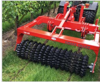
1.80 m with Quick-Push and Star Roller.