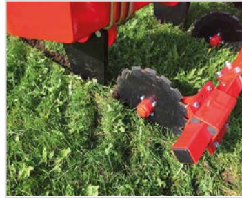
Ø400 mm disc in front of the tine.