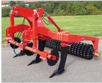
2.50 m with Quick-Push and Star Roller.