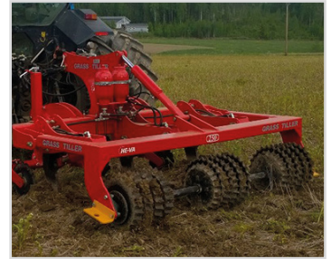
2.50 m with hydr. release system and synchronic Star Roller.