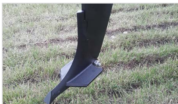
Mounting set for Multi-Seeder, incl. mounting on a new Grass-Tiller.

One special dosing roll for rape/fertilizer is included in the price. One of the following seeding methods is to be chosen as well as one of the Multi-Seeder models.