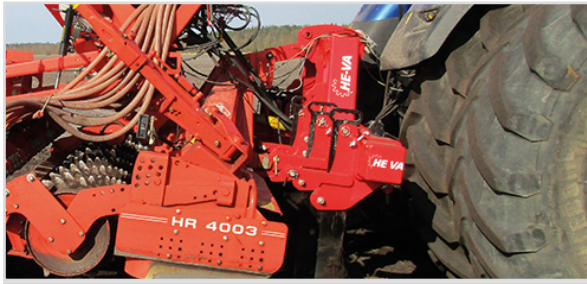
4.00 m Combi-Tiller PTO with 5 tines.