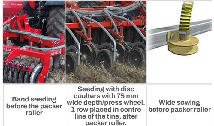
Band seeding before the packer roller

One of the following seeding methods is to be chosen as well as one of the Multi-Seeder models.