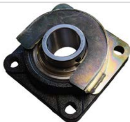
Bearing protector for packing roller.