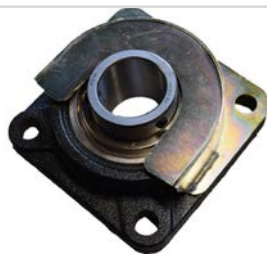
Bearing protector for packing roller.