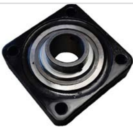
Rubber sealed ball bearings.