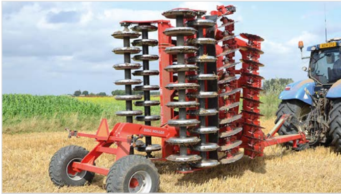
5.50 m Disc-Roller Contour with Twin V-Profile Roller and material damper guard.