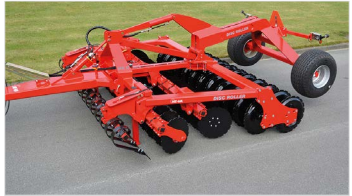
3.50 m Disc-Roller Contour trailed with Twin V-Profile Roller and Spring-Board.