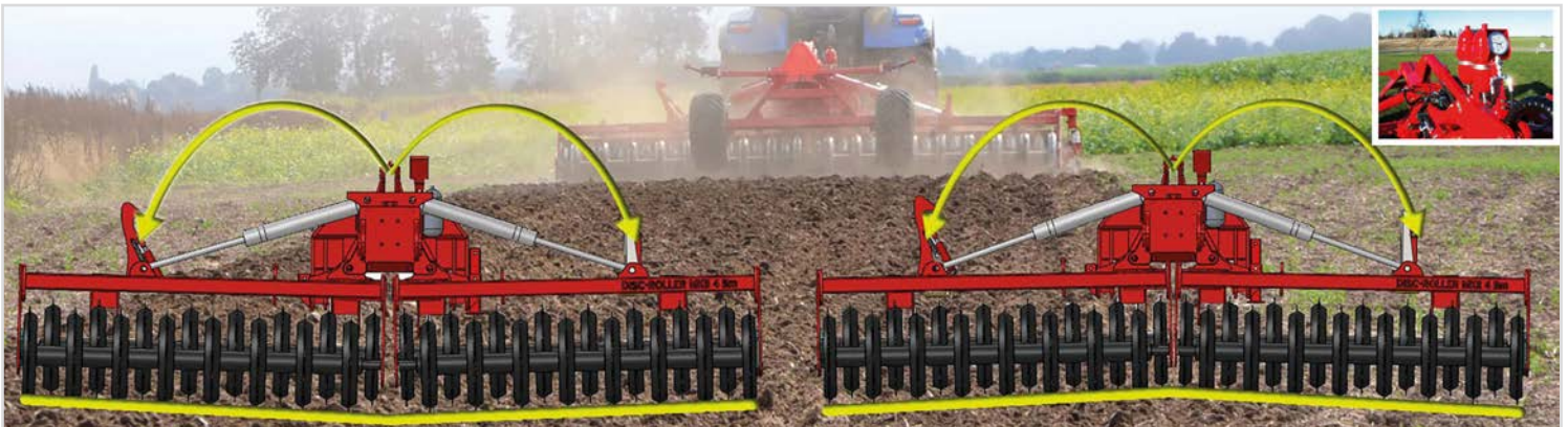
Standard equipment on models with 2 and 3 section: HE-VA SAT-System: Hydr. adjustable weight transfer system, ensuring equal weight transfer in the total working width, resulting in the fact that the wing sections follow the terrain.