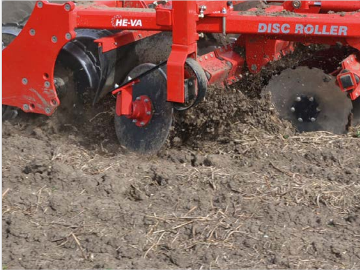
Standard equipment on all models: Adjustable edge disc for retain soil on right side.