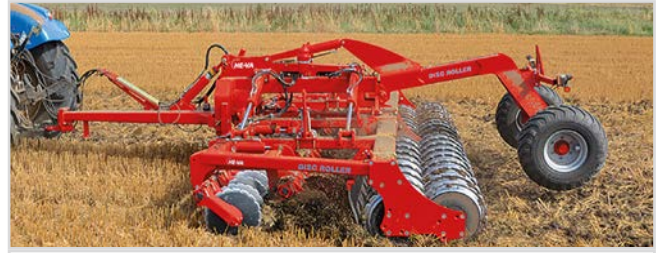
8.00 m Disc-Roller Contour with V-Profile Roller and support wheels.