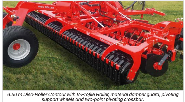
6.50 m Disc-Roller Contour with V-Profile Roller, material damper guard, pivoting support wheels and two-point pivoting crossbar.