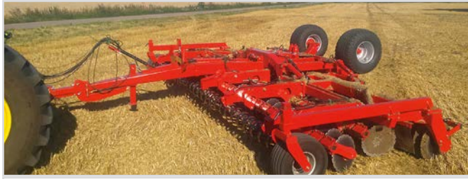
5.50 m Disc-Roller Contour with Twin V-Profile Roller and material damper guard.