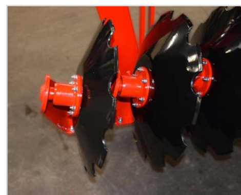
Ø610x6 mm disc with rough profile.