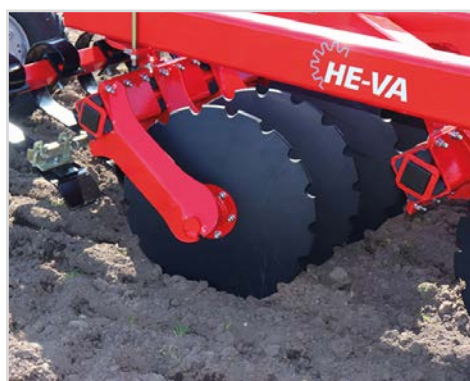
Standard disc, 610x6 mm - fine profile.