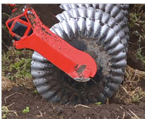
Ø570 x 6 mm profiled mixing disc.