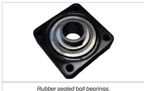
Rubber sealed ball bearings.