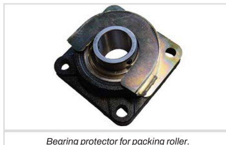
Bearing protector for packing roller.