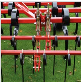
Individual depth adjustment.