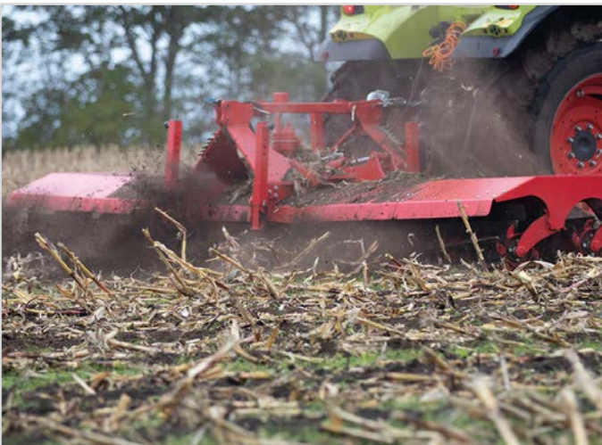
Three-point linkage on Top-Cutter Solo, enabling both front- and rear mounting.