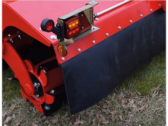
Material damper guard.