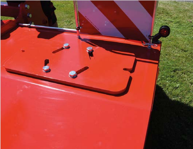
Extra weights of 30 kg. Max. 60 kg./m.