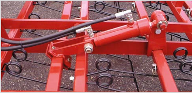
Hydraulically adjustable tine pressure.