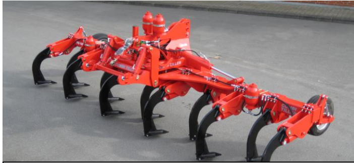
6.00 m Combi-Tiller MKII with 11 tines.