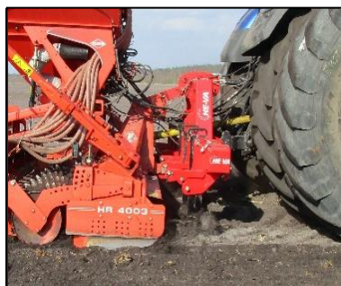
4,0 m Combi-Tiller PTO med 5 tines.

Adjustable height of the rear cross points.