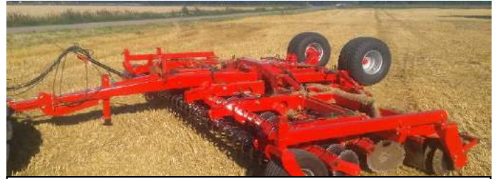
5,50 m Disc-Roller Contour w/Twin V-Profilroller and material damper guard.