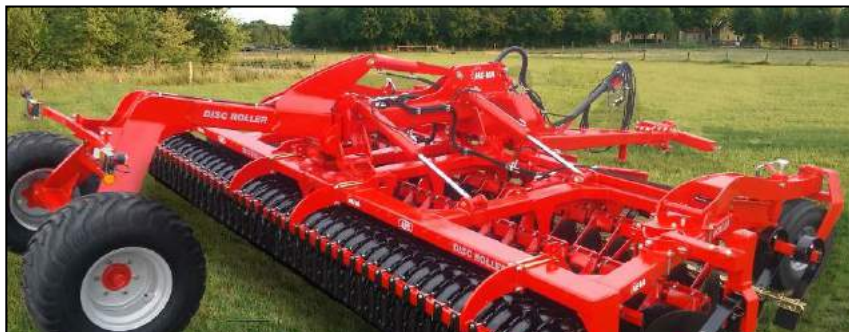
6.50 m Disc-Roller Contour w/V-Profile roller, material-damper guard, pivoting support wheels and two point pivoting crossbar.