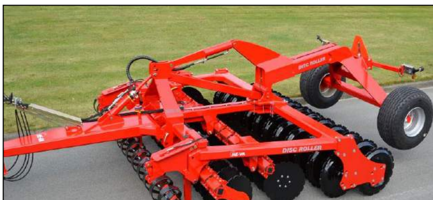
3.50 m Disc-Roller Contour trailed w/Twin V-Profile roller and Spring-Board.