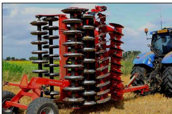
5.50 m Disc-Roller Contour w/Twin V-Profile roller and material-damper guard.