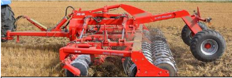
8,00 m Disc-Roller Contour with V-Profilroller, support wheels.