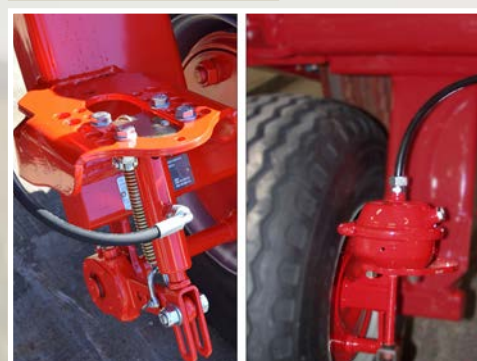
Hydraulic / Air brakes