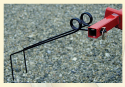
Ø7 mm x 600 mm long lasting double tine mounted by a 11 mm easy changeable linch pin. For hard and clayish soil a 7 x 450 mm double tine is available. The tine replacement is quick and easy without tools.