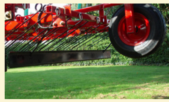
Extra equipment: Levelling plate. Very effective - for example for levelling of molehills.

Normal weeding is carried out from 8-10 days after germination when the crops typically have 2-4 leaves, 14 days is the maximum delay. The best result is obtained with a centre position tine angle, a working depth of 1-2 cm and at approx. 5 km/h.