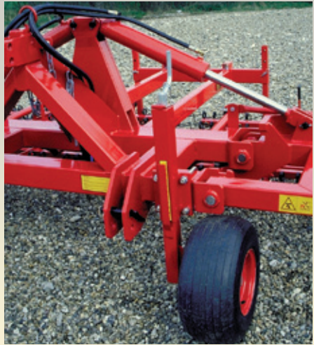
Spindle infinitely adjustable low profile wheels, 16x6.5, 6PLY on 3m - 7.5m. As standard on 9m & 12m models two additional wheels, 18.5x8.5x8, 6 PLY are supplied. However, bigger wheels are supplied on Weeder HD models.

The HE-VA Weeder & HE-VA Weeder HD are sturdy and user-friendly units for weeding crops and aerating grasslands. The HE-VA Weeders are quality products reflecting all the demands of the modern farmer.