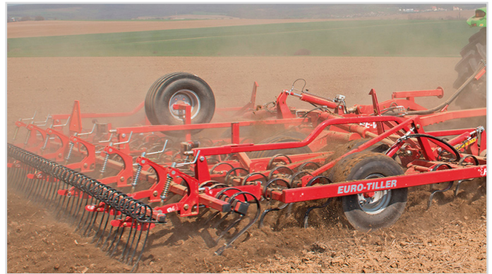
6.00 m Euro-Tiller w/Strong front harrow, Spring-Board levelling bar, Spring-Board after-harrow, long finger after-harrow and spare wheel.