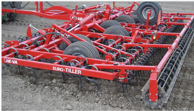
8.00 m Euro-Tiller w/ Spring-Board levelling bar, Flat bar roller incl. long finger after-harrow and spare wheel.