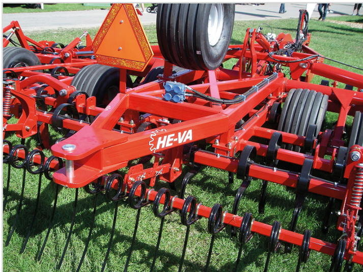
Euro-Tiller with rear draw-bar.