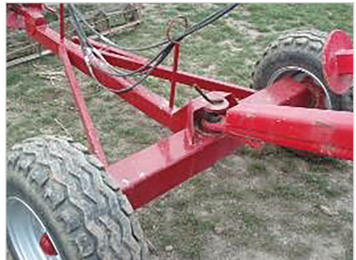
Dolly: wheel set making an attachment of rollers possible behind a harrow - 11.5/80 x 15.3 wheel.