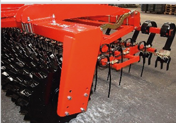
Equipment Package 7