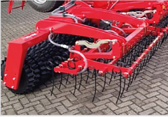
Equipment Package 2