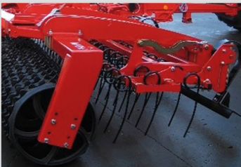
Equipment Package 6