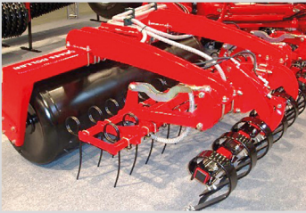
Equipment Package 4