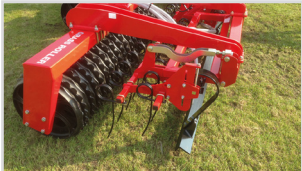
Equipment Package - COMPACT 2

*Requires 1 additional double-acting oil outlet