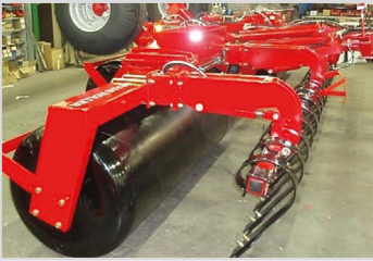
Equipment Package 5