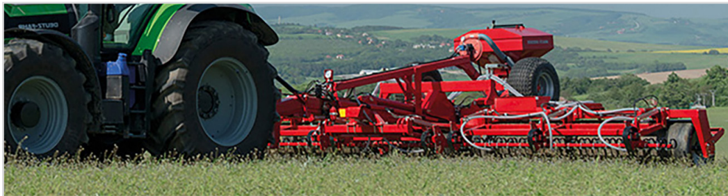
6.30 m Grass-Roller Ø710 mm with package 3 and Multi-Seeder