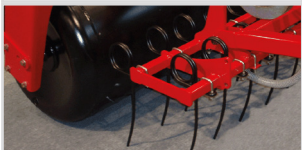
Equipment Package - COMPACT 3

*Requires 1 additional double-acting oil outlet