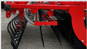
Equipment Package - COMPACT 1