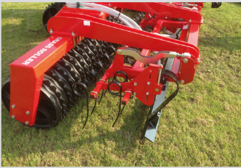
Equipment Package 3