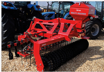
2.90 m three-point mounted Grass-Roller with Star rings and equipment package 4