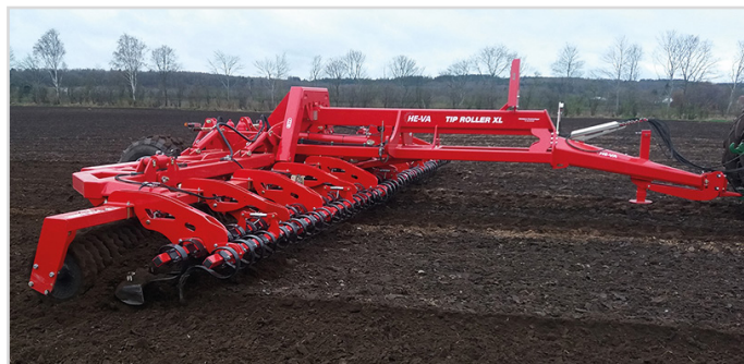
12.30 m Tip-Roller XL with Cambridge rings and 2-row Spring-Board