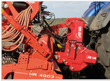
4.00 m Combi-Tiller PTO with 5 tines.