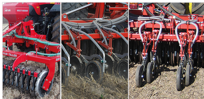
Band seeding before the packer roller

When sowing with disc coulters, a parallelogram-suspended Hatzenbichler disc coulters with double disc is used. The disc has a diameter of Ø350 and a thickness of 3 mm, while the pressure roller has a diameter of Ø330 and is either 75 or 50 mm wide.