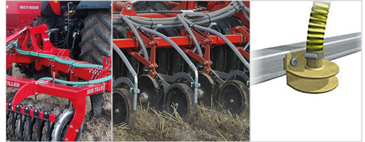
Band seeding before the packer roller

Mounting set for Multi-Seeder, incl. mounting on a new Stealth. One special dosing roll for rape/fertilizer is included in the price. One of the following seeding methods is to be chosen as well as one of the Multi-Seeder models.