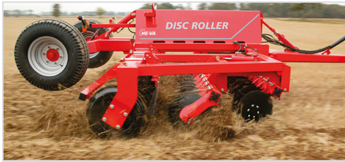
5.00 m with V-Profile ring and material damper guard.