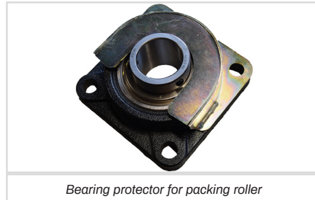
Bearing protector for packing roller