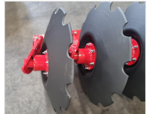
Ø610 mm disc with rough profile