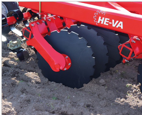
Standard disc, 610 mm - fine profile