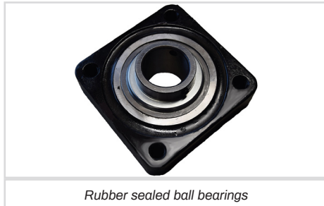
Rubber sealed ball bearings