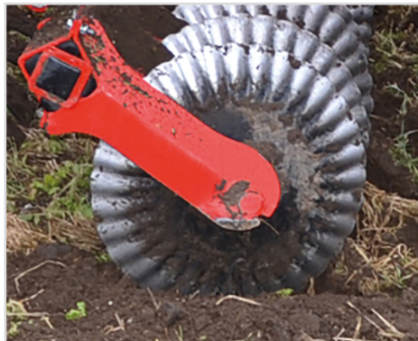
Ø570 x 5 mm profiled mixing disc