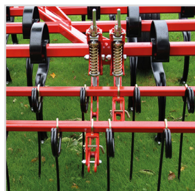
Individual depth adjustment