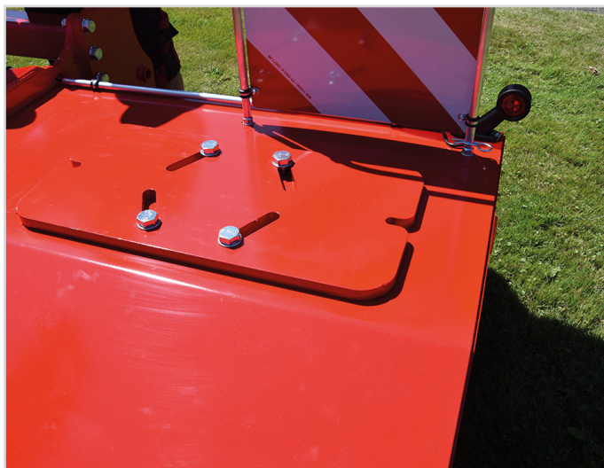
Extra weights of 30 kg. Max. 90 kg./m