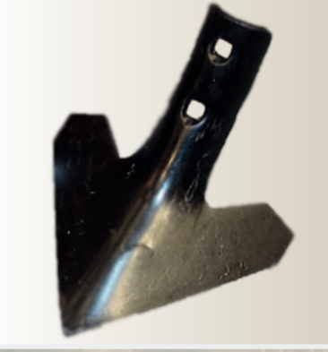
65x12 mm tines with 15 cm row spacing for a lighter harrowing to maintain the surface structure. This tine allows the harrow to be used for light stubble preparation, a full cutting of the surface is ensured with the 180x6 mm goosefoot point.