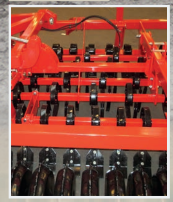
45x12 mm tines with 8.5 cm row spacing for a fine and uniform seedbed preparation.