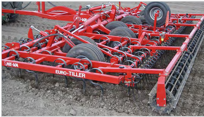
8.00 m Euro-Tiller w/ Spring-Board levelling bar, Flat bar roller incl. long finger after-harrow and spare wheel.