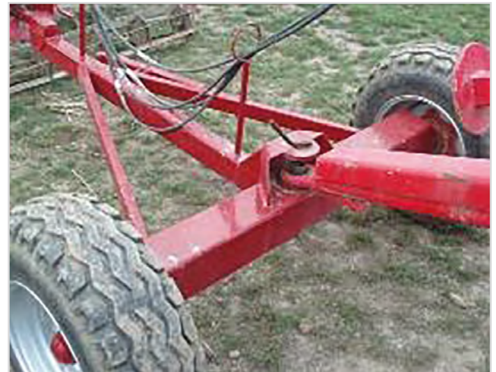
Dolly: wheel set making an attachment of rollers possible behind a harrow - 11.5/80 x 15.3 wheel.