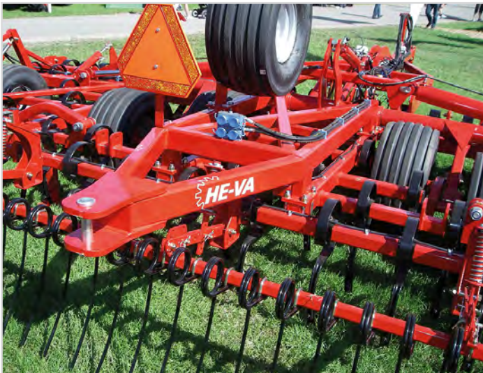
Euro-Tiller with rear drawbar.