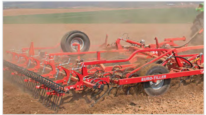
6.00 m Euro-Tiller w/Strong front harrow, Spring-Board levelling bar, Spring-Board after-harrow, long finger after-harrow and spare wheel.