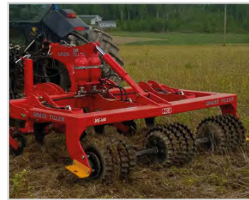
2.50 m with hydr. release system and synchronic Star Roller.