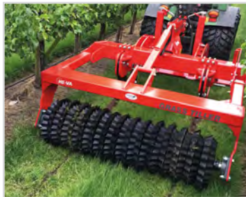
1.80 m with Quick-Push and Star Roller.