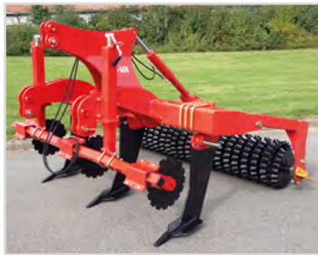
2.50 m with Quick-Push and Star Roller.