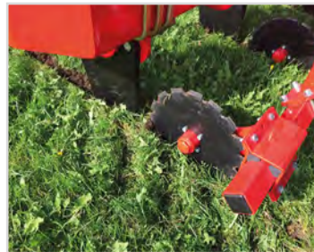
Ø400 mm disc in front of the tine.