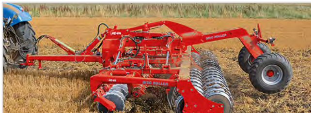
8.00 m Disc-Roller Contour with V-Profile Roller and support wheels.