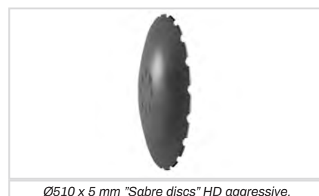
Ø510 x 5 mm "Sabre discs" HD aggressive.