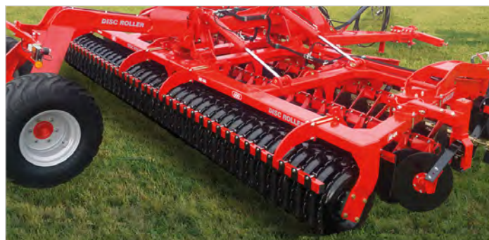
6.50 m Disc-Roller Contour with V-Profile Roller, material damper guard, pivoting support wheels and two-point pivoting crossbar.