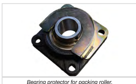
Bearing protector for packing roller.