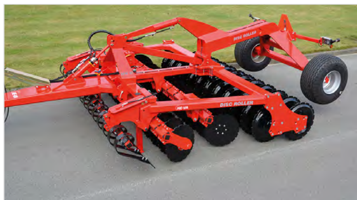
3.50 m Disc-Roller Contour trailed with Twin V-Profile Roller and Spring-Board.