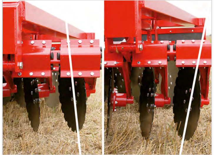
Standard equipment on all models: "DSD": Depth Synchronized Disc-Aggressiveness.