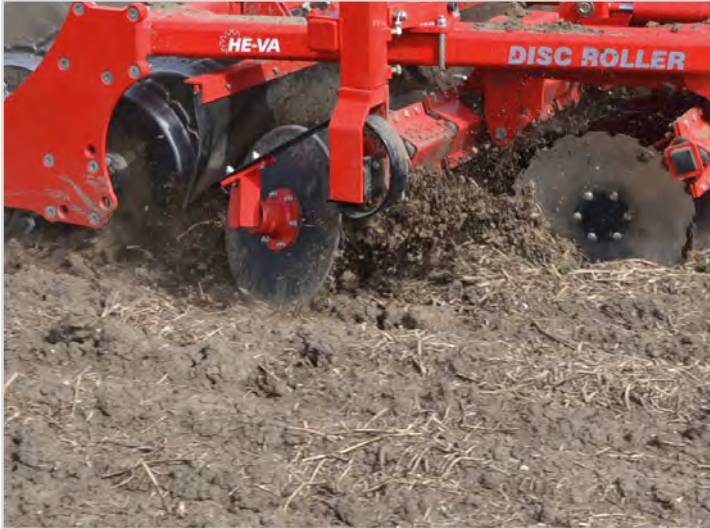
Standard equipment on all models: Adjustable edge disc for retain soil on right side.