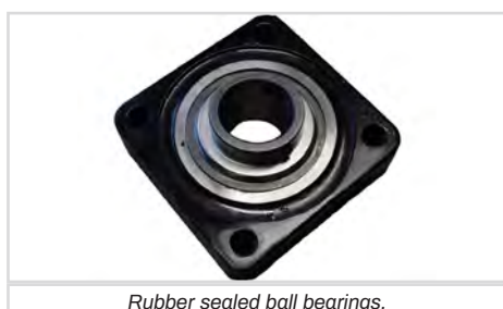
Rubber sealed ball bearings.