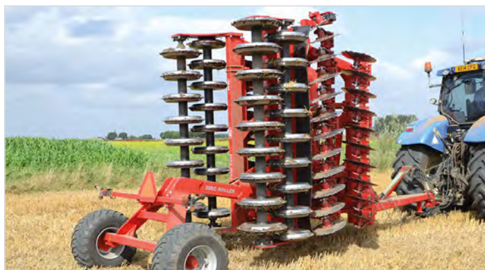
5.50 m Disc-Roller Contour with Twin V-Profile Roller and material damper guard.