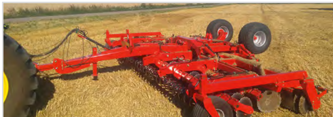
5.50 m Disc-Roller Contour with Twin V-Profile Roller and material damper guard.