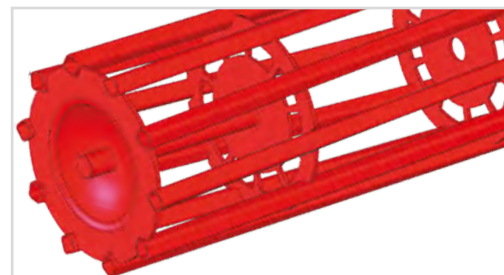
Tube Roller Ø550 mm.