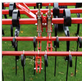
Individual depth adjustment.