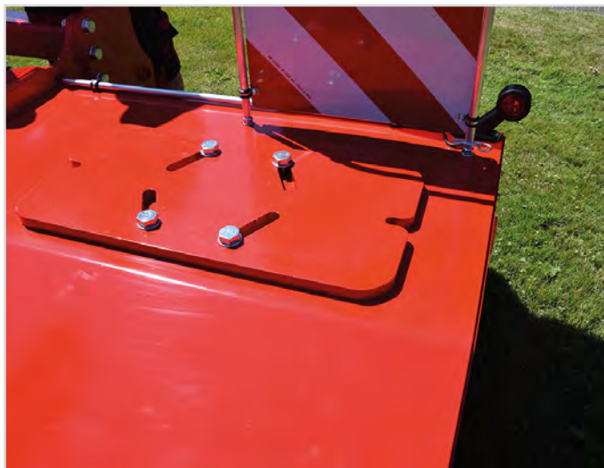
Extra weights of 30 kg. Max. 60 kg./m.