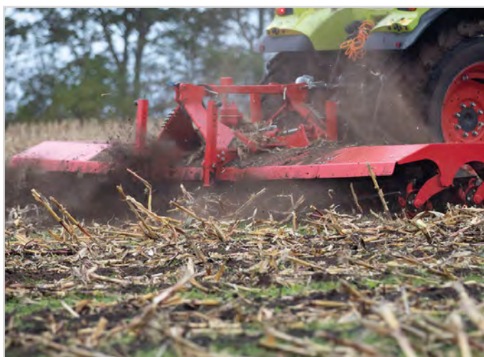
Three-point linkage on Top-Cutter Solo, enabling both front- and rear mounting.