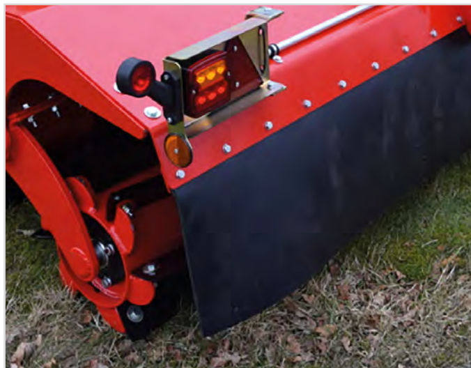
Material damper guard.