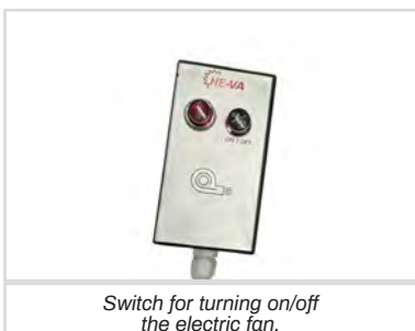
Switch for turning on/off the electric fan.