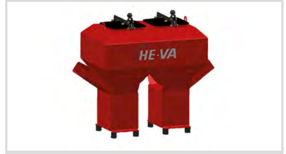
Multi-Seeder Twin 90/140-12-HY-AC 668 x 800 (1,180) mm H=900 (1,076) mm