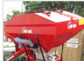
660-8-HY-FZ-AC 900x1,400 mm H=1,170 (1,320) mm