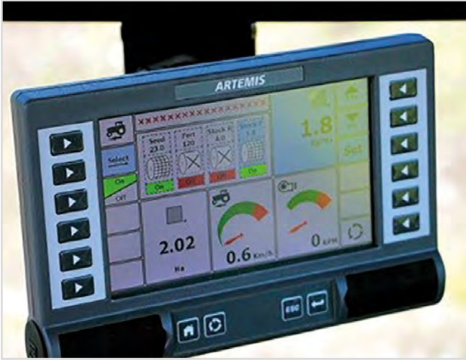
HE-VA terminal for Multi-Seeder Twin and for mounting 2-3 Multi-Seeders.