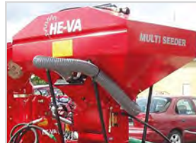
410-8-HY 800x1,200 mm H=1,030 (1,180) mm