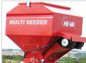
200-8-EL 650x650(770)mm H=980 mm