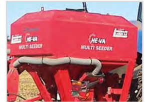
1150-8-HY-FZ-AC 1,014x1,640 mm H= 1,530 mm