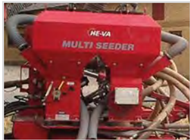
Twin 2 x 100 593x926(1.180)mm H=935 (1.075) mm