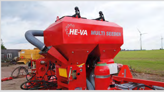
Multi-Seeder Twin 2x100-8-HY-AC 593 x 926 (1,180) mm H=935 (1,075) mm