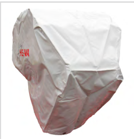
Tarpaulin for Multi-Seeder.

*In case of another length of driving cable than the standard 1.8 m, the price will be corrected in relation to standard price.