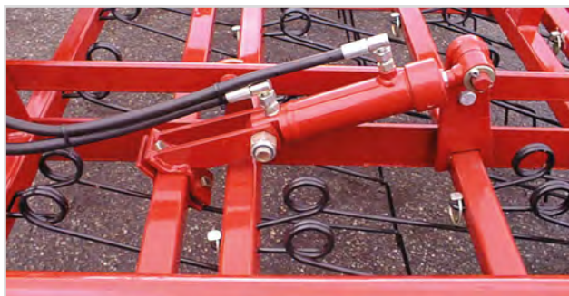
Hydraulically adjustable tine pressure.