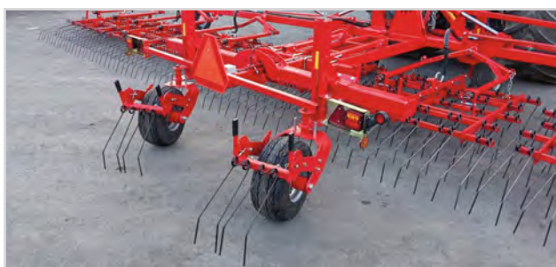
Wheel set, rear.

1* The equipment requires 1 additional double-acting oil outlet.