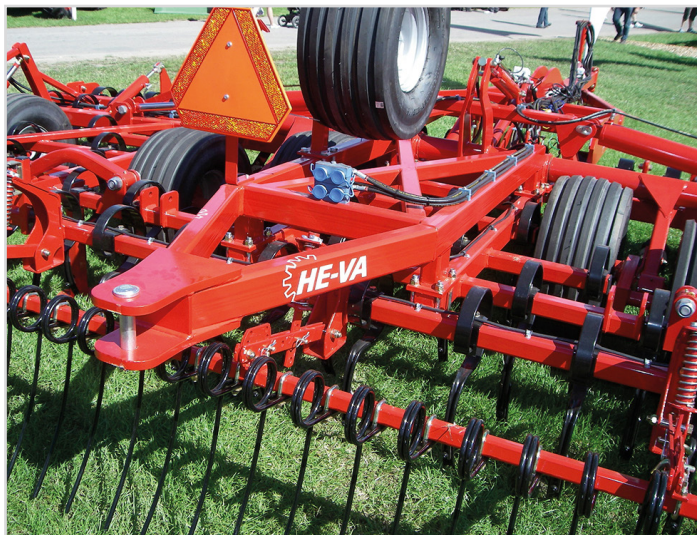
Euro-Tiller with rear drawbar.