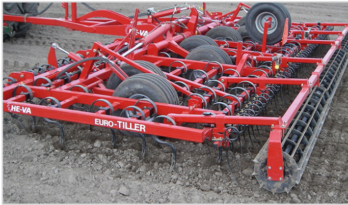
8.00 m Euro-Tiller w/ Spring-Board levelling bar, Flat bar roller incl. long finger after-harrow and spare wheel.