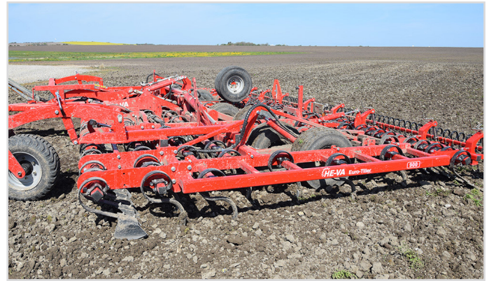
9.00 m Euro-Tiller w/65x12 mm tines w/Spring-Board, extra row of 65x12 mm tines, Spring-Board after-harrow, longfinger after-harrow, and front support wheel