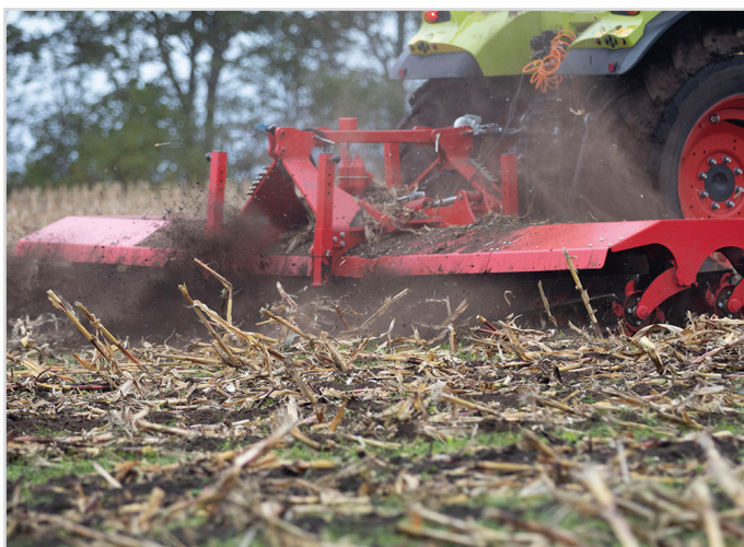
Three-point linkage on Top-Cutter Solo, enabling both front- and rear mounting.