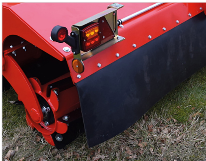
Material damper guard.